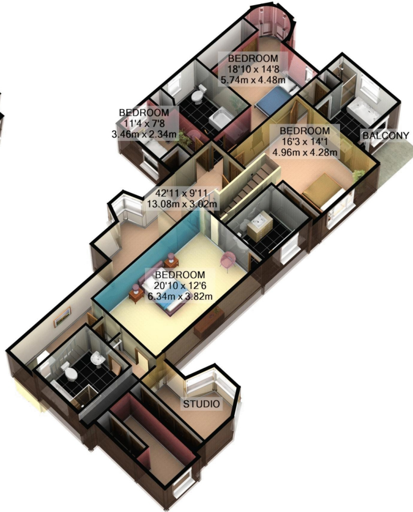
1st Floor Approx. Floor Area 1688 Sq.Ft. (156.8 Sq.M.)