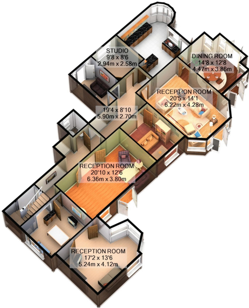
Ground Floor Approx. Floor Area 1803 Sq.Ft. (167.5 Sq.M.)