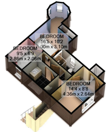
2nd Floor Approx. Floor Area 494 Sq.Ft. (45.9 Sq.M.)

Total Approx. Floor Area 3984 Sq.Ft. (370.1 Sq.M.)