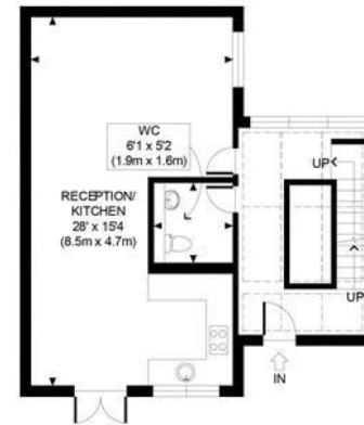
GROUND FLOOR GROSS INTERNAL FLOOR AREA 596 SQ FT

APPROX. GROSS INTERNAL FLOOR AREA 1875 SQ FT / 174 SQM