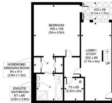
BASEMENT GROSS INTERNAL FLOOR AREA 711 SQ FT