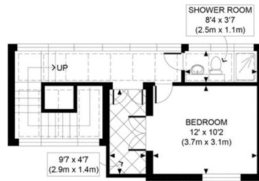
SECOND FLOOR GROSS INTERNAL FLOOR AREA 293 SQ FT