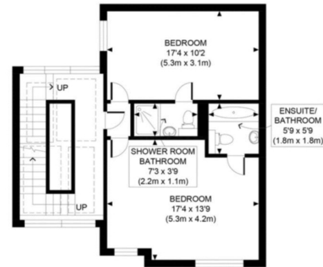
FIRST FLOOR GROSS INTERNAL FLOOR AREA 655 SQ FT