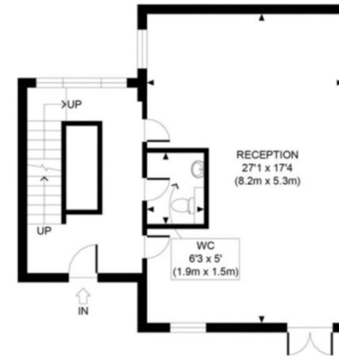
GROUND FLOOR GROSS INTERNAL FLOOR AREA 639 SQ FT

APPROX. GROSS INTERNAL FLOOR AREA 2276 SQ FT / 211 SQM Ref: Copyright photoplan