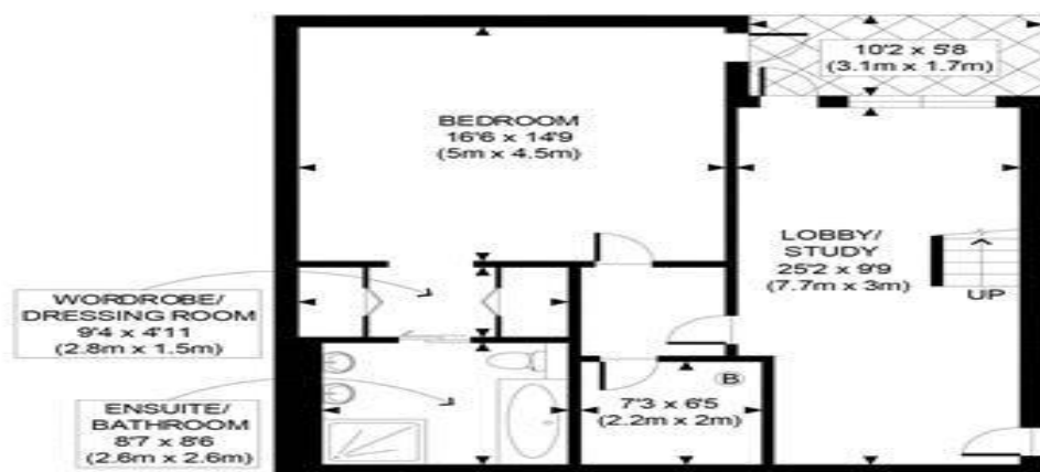
BASEMENT GROSS INTERNAL FLOOR AREA 711 SQ FT