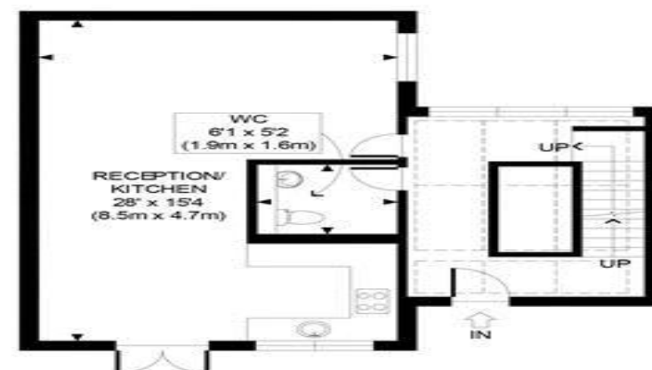
GROUND FLOOR GROSS INTERNAL FLOOR AREA 596 SQ FT

APPROX. GROSS INTERNAL FLOOR AREA 1875 SQ FT / 174 SQM