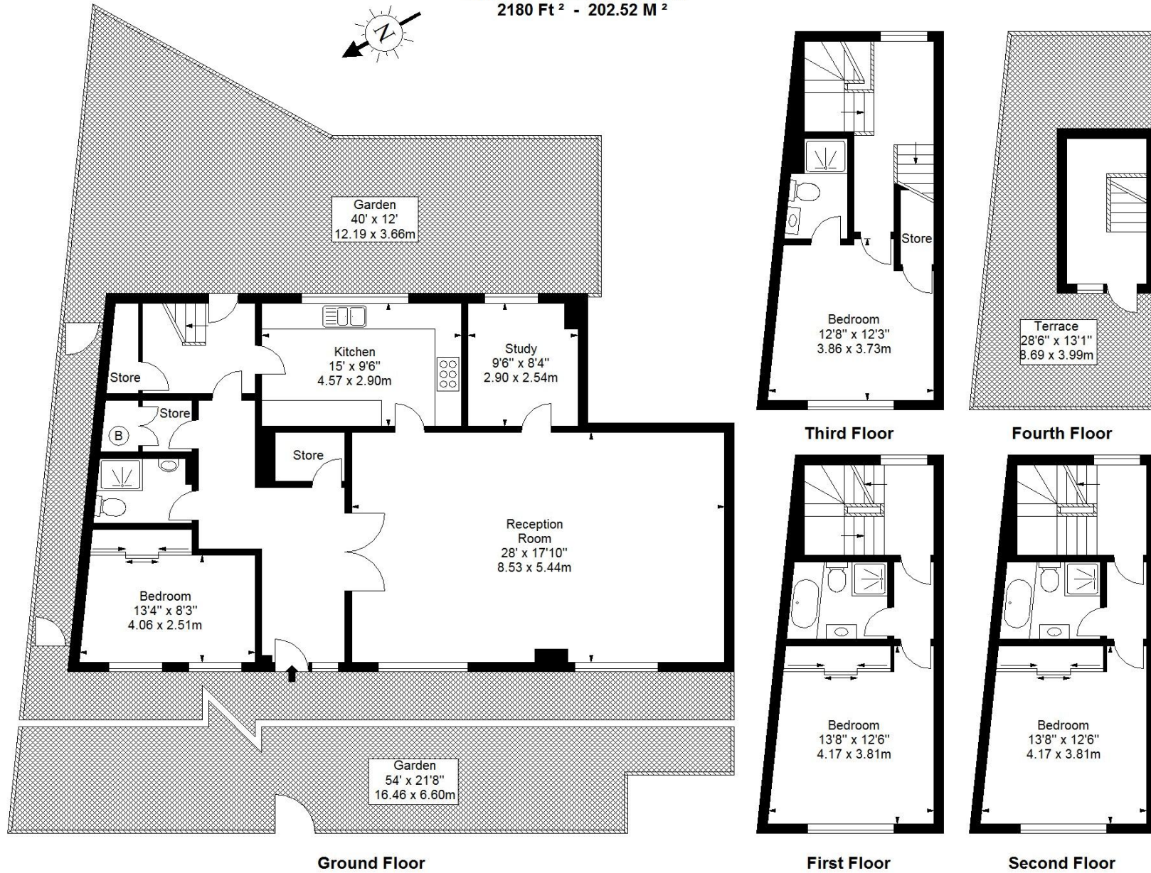
Illustration For Identification Purposes Only. Not To Scale

* As Defined by RICS - Code of Measuring Practice